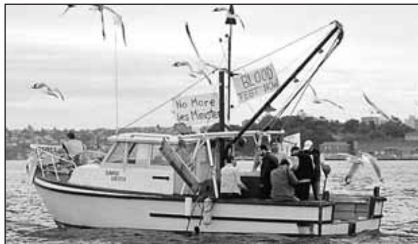
Anger on the Harbour . . . fishermen protest yesterday.

Mr Iemma said the Health Department would offer up to 42 commercial fishermen and