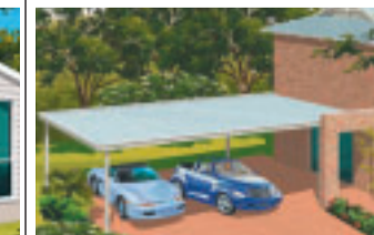
CARPORTS BUILT TO LAST Built strong in steel. Complete with gutters, downpipes - the lot. FROM $1,990