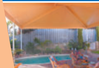
TIMBERGRAIN-LOOK PATIOS In 30% cool heat-reflective Cherry Oak or Tassie Oak steel finishes. FROM $2,490

AUTUMN SALE OF AUSDECK PATIOS • ROOMS • CARPORTS • GARAGES