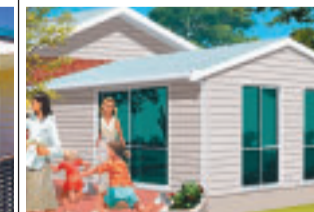
GAMES ROOMS OR THEATERETTES Add space & value to your home with a new family leisure room. FROM $12,900