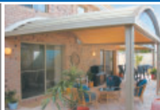
MODERN DOME STYLE PATIOS Cooler, heat-reflective, hi-gloss, wide span roofing, fewer pillars & beams. FROM $4,820