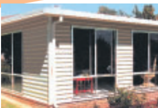
AFFORDABLE FACILITY ROOMS The lowest cost way of adding extra space for family activities and living. FROM $9,900