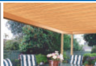
EXPANSIVE FLAT ROOF PATIOS Includes gutters, downpipes, trusses, trims, barge boards in one great package. FROM $1,950