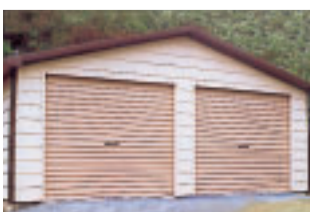
FEDERATION-STYLE GARAGES Double or single, gable or flat roof styles. Good looking powder-coat colour finish and solid construction. Many more styles to see before you buy, and on display. FROM $2,990