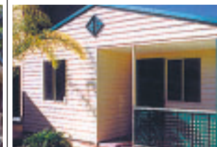
SELF-CONTAINED GRANNY UNITS Cottages for 1 or 2 people, featuring bedroom, lounge, kitchen, verandah. FROM $55,000