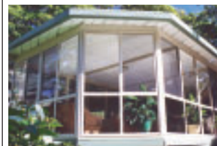
SUPERB GLASS CONSERVATORIES Add a spacious glass room with sliding doors, insulated roofs, insect screens. FROM $16,900