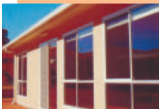
ADD-A-ROOM FOR LOWER COST For around half the cost of brick & tile, add extra space in around 4 weeks. FROM $12,900