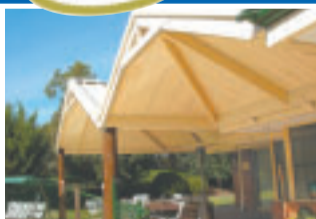
STYLISH GABLE ROOF PATIOS No warping, cracking or repainting like timber. Bluescope steel strength & quality. FROM $2,999