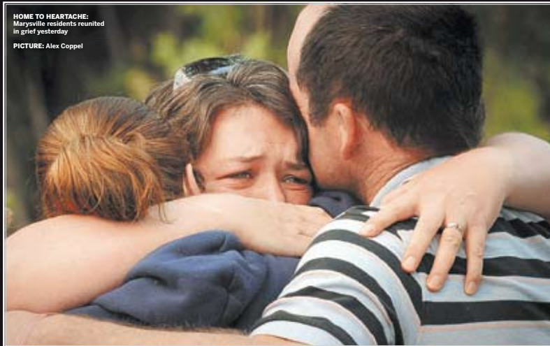
HOME TO HEARTACHE: Marysville residents reunited in grief yesterday