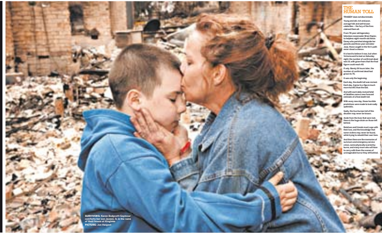
A woman kisses her young son in the rubble of a destroyed home in Victoria.

“We will find more bodies as we gain access to different parts of the fire areas. So far we have found people in cars. We have found people on their properties, in paddocks. We've found others in their houses. It covers the whole range.” Victoria's Commissioner of Coroner's Court