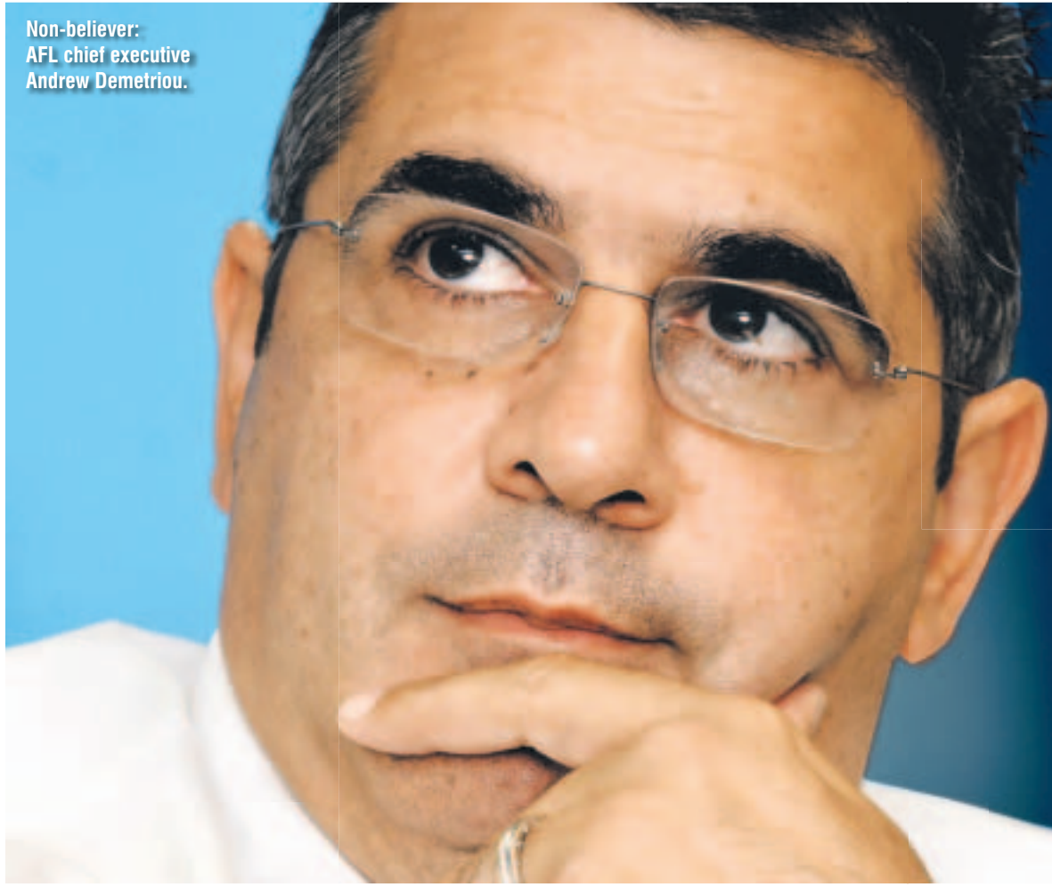
Non-believer: AFL chief executive Andrew Demetriou.

PLUS GERARD HEALY: WHO IS THE AFL'S BEST DEFENDER?