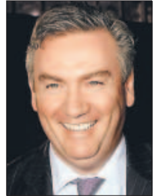
Succession plan: Eddie McGuire last night.